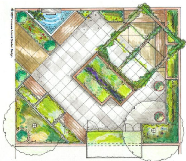
The Hearts and Mind Garden by Vanessa Adorni

Materials have been carefully chosen to avoid confusion, offer contrast and provide interest. There are raised beds and two stainless steel sculptures that offer tactile and visual interest. In 2011 Thrive will embark on another ambitious garden project, creating four new gardens at Thrive HQ: an old walled fruit garden will soon be transformed into a Garden Gallery holding five small gardens designed to suit the needs of specific disabilities