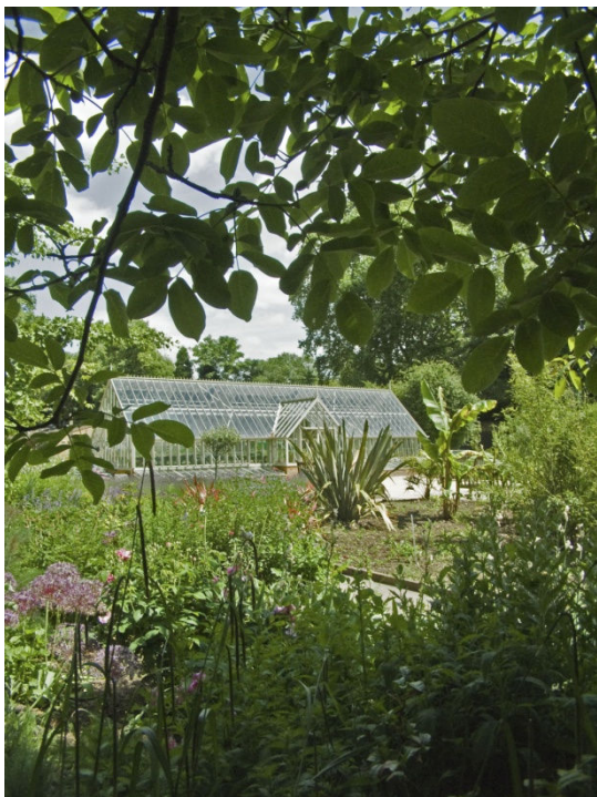
THE HERB GARDEN. BATTERSEA

At Battersea , why not visit us as part of London Open Squares Weekend on June 11 and 12 11am and 4pm. at The Herb Garden in Battersea Park. Sample some delicious home-made refreshments and join in the fun for grown ups and children at our beautiful and award-winning Herb Garden in Battersea Park. By taking part in the tombola, raffle and everything else on offer you'll be helping to raise the funds we urgently need to support our work.