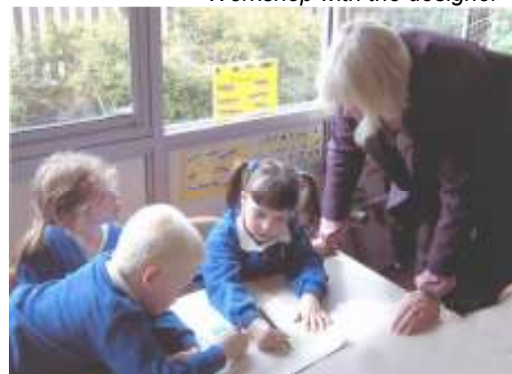
Workshop with the designer

The children worked in groups first on a big plan, then individually on smaller plans.