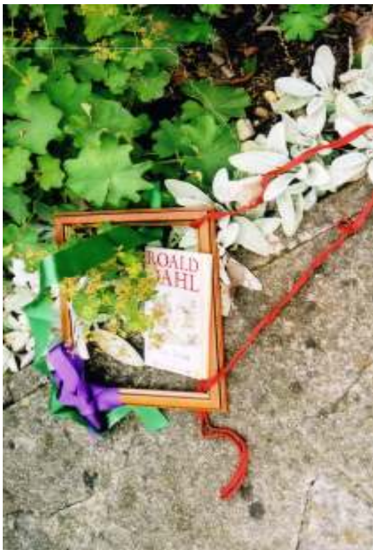
A self portrait by a family and their friends at Noak Hill

Wind chime of memories made by families at Noak Hill reflecting on their day.