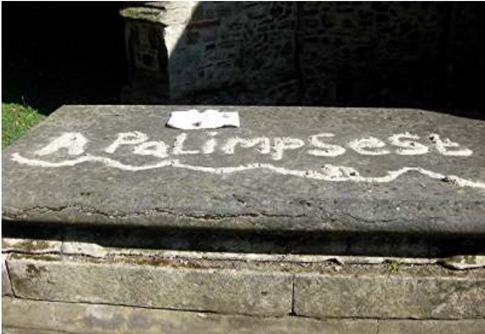
Palimpsest – sand on stone reveals something lost long ago, a transitory moment exposed.